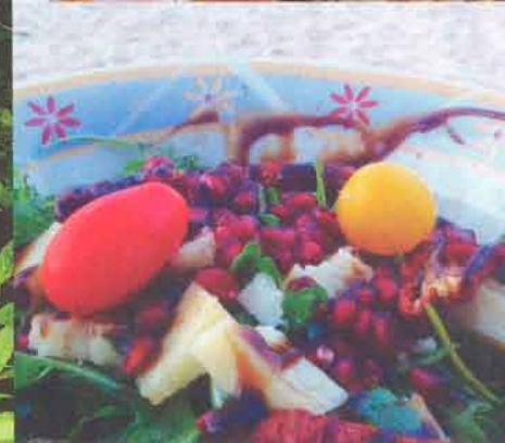
FROM TOP Cool woodland stream; local honey; imaginative salads

tourist board. It's an enjoyable ramble as the sunshine mingles with cool sea breezes carrying the scents of sage and thyme. The central fortress and the amphitheatre are the most intact, their weathered stones still commanding.